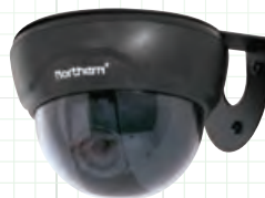
D212H960 Shown with Wall Mount (included)