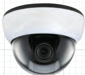
D212H960 Shown with White Cover (included)