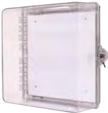
STI-7530 with Key Lock