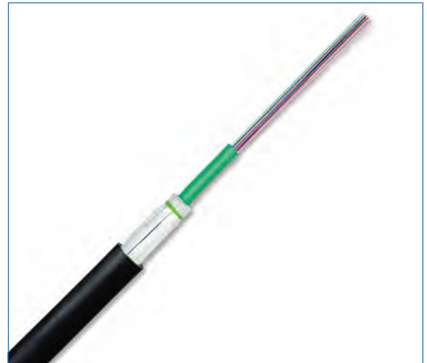
Part Number: 012TEU-13188A2G