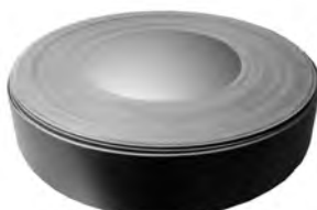
4" Roll @ 100' - Part No. 10140