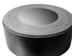
5.5" Roll @ 100' - Part No. 10141