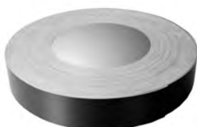
2.5" Roll @ 100' - Part No. 10139