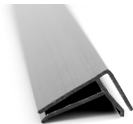
90° Profile - Part No. 10132