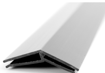
45° Profile - Part No. 10134