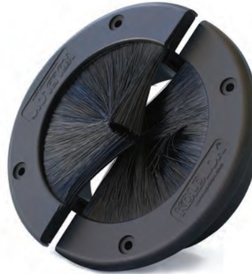
Round 6" Floor Grommet Part No. 40003