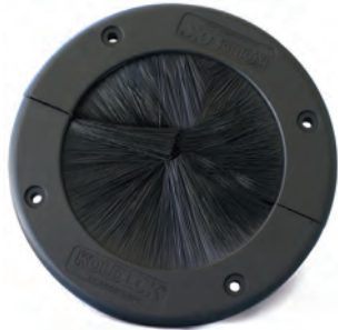
Round 4" Floor Grommet Part No. 40001