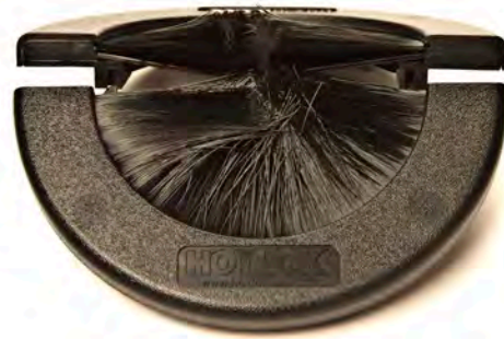
Round 4" Rack Mount Grommet - Part No. 40002