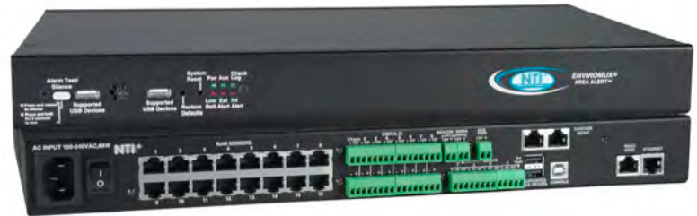
ENVIROMUX-16D (Front & Back)