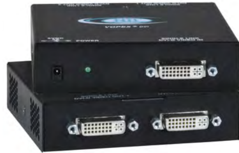
VOPEX-DVI4K-2 (Front and Back)

The VOPEX® DVI/HDMI 4K Video Splitter simultaneously displays the same Ultra-HD 4Kx2K image from one single link DVI/HDMI video source to two displays.