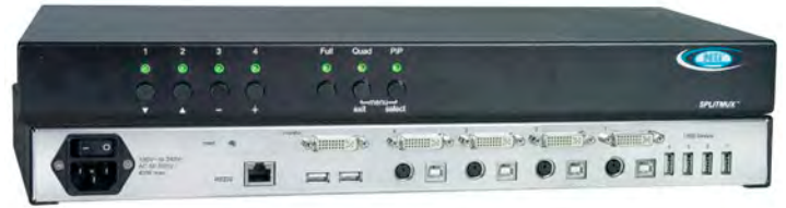
SPLITMUX-DVI-4 (Front & Back)

The SPLITMUX® DVI/VGA Quad Screen Multiviewer allows you to simultaneously display video from four different computers on a single monitor. Additionally, it can switch one of the four attached computers to a shared keyboard and mouse for operation and to four additional USB devices.