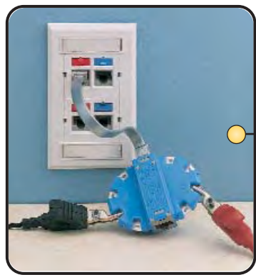
MODAPT.....Test adapter with one 152mm (6 in.) 4-pair universal plug-ended modular cord

One MODAPT allows access to 1-, 2-, 3-, and 4-pair keyed and non-keyed jacks and plugs