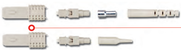
SC Simplex Connector for Jacketed and Buffered Fiber

Strain and bend relief boots provide improved plug-to-cable retention and maximum performance by preventing fiber deformation caused by mechanical strain