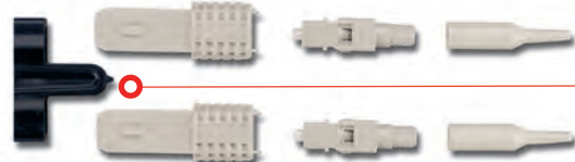
SC Duplex Connector for Buffered Fiber

ST coupling nut is metallic to assure optimum durability and engagement. Ramps are radial to facilitate mating/de-mating