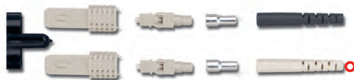
SC Duplex Connector for Jacketed Fiber

SC duplex configuration features a duplexing clip, which allows each connector to be removed individually. The duplexing clip also speeds troubleshooting — an individual connector can be removed and re-terminated without disturbing the adjacent connector