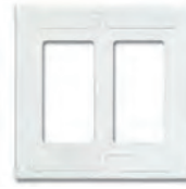
DR-D-(XX) ..... Double gang Designer faceplate