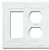
DRE-D-(XX) ..... Double gang Designer/Duplex faceplate