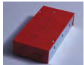
R-14E & R-24E Enclosure