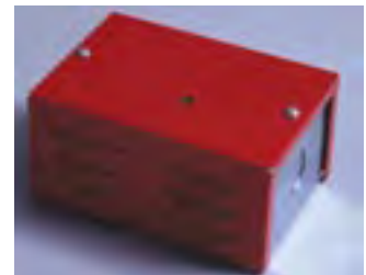
R-10E & R-20E Enclosure