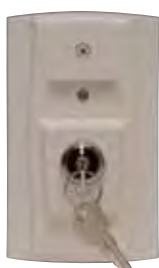
RTS151KEY UL S2522