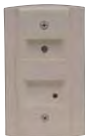
RTS151 UL S4011

System Sensor provides system flexibility with a variety of accessories, including two remote test stations and several different means of visible and audible system annunciation. As with our duct smoke detectors, all duct smoke detector accessories are UL listed.