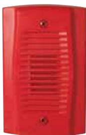
MHR UL S4011