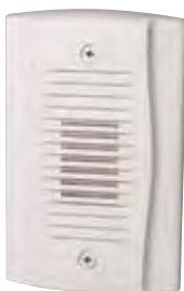
MHW UL S4011