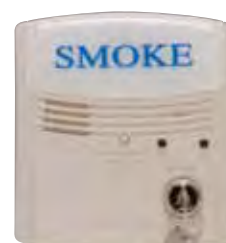
RTS2-AOS UL S2522