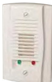
APA151 UL S4011