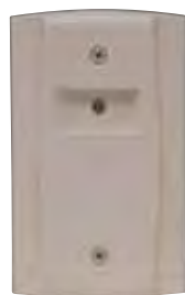
RA100Z UL S2522