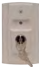
RTS151KEY UL S2522