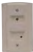
RTS151 UL S2522

System Sensor provides system flexibility with a variety of accessories, including two remote test stations and different means of visible and audible system annunciation. As with our duct smoke detectors, all duct smoke detector accessories are UL listed.