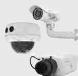
Illustra IP Cameras