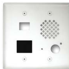
PNL75-WH (Satin White)