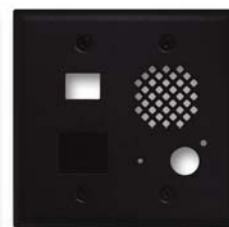
PNL75-BK (Fine Texture Satin Black)

The PNL75 is a replacement faceplate with color matching screws and LED light pipe for the E-75 Series entry phones.