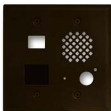
PNL75-BN (Oil Rubbed Bronze)