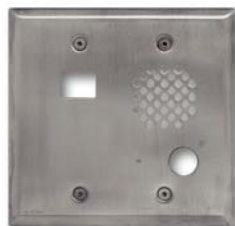
PNL65-SS (Brushed Stainless Steel)

Update Your E-65 Series Phone to a Unique Faceplate Finish or Replace an Existing Damaged Faceplate