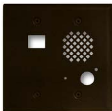
PNL65-BN (Oil Rubbed Bronze)