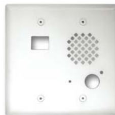
PNL65-WH (Satin White)