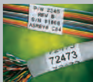
Wire & Cable Labeling