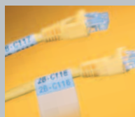
Voice & Data Communications