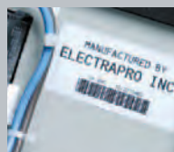
Industrial Barcode Labels