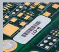
Circuit Board Materials