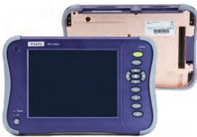
Back of the module carrier where other modules are attached

The multidimensional design of the T-BERD/MTS-6000A (V2) provides optimal configuration flexibility with extended battery life. The E6100 module carrier is best suited for fiber applications; whereas, the high-powered battery in the E6200 module carrier extends battery life when used with the carrier Ethernet (MSAM) or other intensive fiber applications.