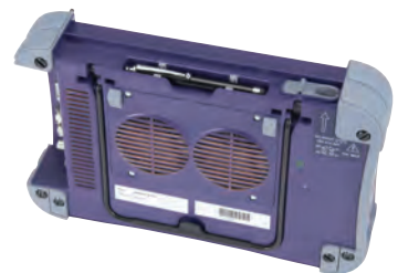
E6200 MSAM and Fiber module carrier