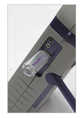
USB flash drive supports transferring test results