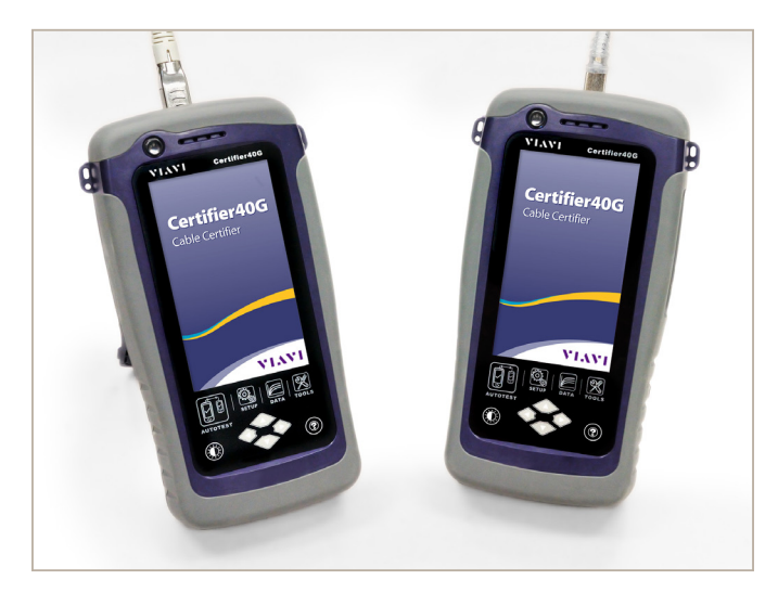
Two complete units minimize time initiating, naming, and saving results