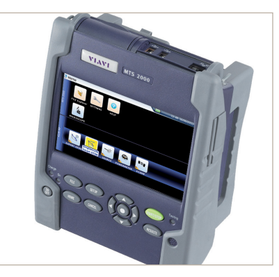
For more fiber testing and certification capabilities, combine the Certifier40G with one of the market-leading Viavi fiber testers, such as the T-BERD/MTS-2000