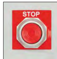
Raised Panel Labels