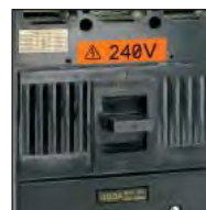
Electrical Hazard Labels