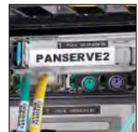
Network Infrastructure Labeling