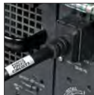
Electrical Infrastructure Labeling