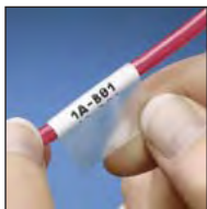
Wire and Cable Marking