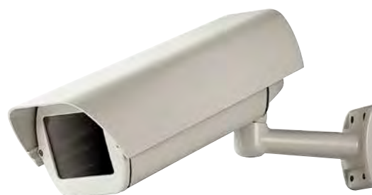
HEB + WBOVA2