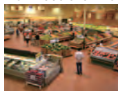
2nd Streaming VGA video of a cropped area