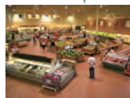
1st Streaming VGA video of a whole