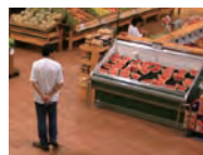
2nd Streaming VGA video of a cropped area