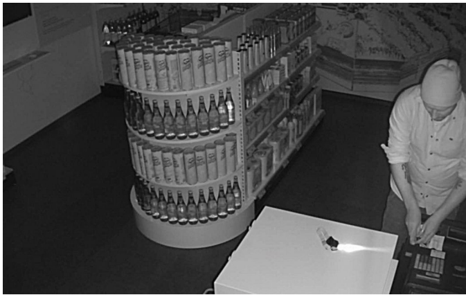
As light diminishes below a certain level, the cameras can automatically switch to night mode to deliver quality images in dark environments.

AXIS M11-L Series provides day and night varifocal built-in lens and adjustable IR LED illumination for optimal light in selected viewing angles. With Axis OptimizedIR, a power-efficient LED technology that provides an adaptable angle of IR illumination and discreet integration of IR LEDs, the cameras provide automatic illumination of a scene in complete darkness, at an event or when requested by a user. The IR LED illumination which is invisible to the human eye, is perfect for discovering objects in a range of up to 15 meters (50 ft)