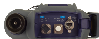
OLTS-85P quad connectors