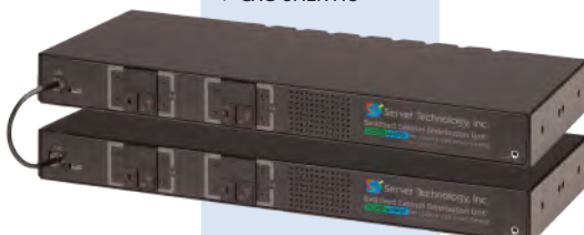
Rear View: linking input