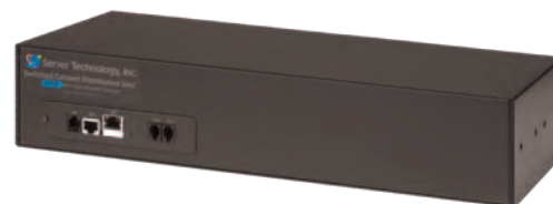
Rear View: Linking port and circuit breakers