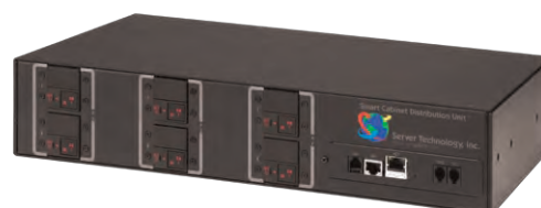
Rear View: breakers, network, serial, linking and temperature/humidity inputs

Expansion Module Model Numbers > CL-6HDX452B4 > CL-6HDV452B4 > CL-6HYY452B4