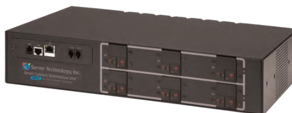
Rear View: Network card and 20A circuit breakers