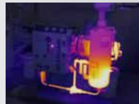
75 % blending