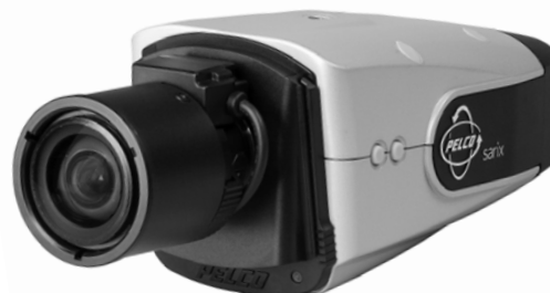
(LENS NOT SUPPLIED WITH CAMERA)

The IXE10LW Series can support two simultaneous video streams. The two streams can be compressed in MJPEG and H.264 formats across several resolution configurations. The IXE10LW Series offers real time video (30 ips) with HD resolution using H.264 compression for optimized bandwidth and storage efficiency. The streams can be configured to a variety of frame rates, bit rates, and GOP (group of pictures) structures for additional bandwidth administration.