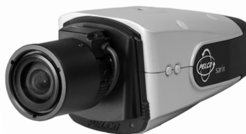
(LENS NOT SUPPLIED WITH CAMERA)

The IXE10 Series can support two simultaneous video streams. The two streams can be compressed in MJPEG and H.264 formats across several resolution configurations. The extended platform gives real time video (30 ips) with HD resolution using H.264 compression for optimized bandwidth and storage efficiency. The streams can be configured to a variety of frame rates, bit rates, and GOP (group of pictures) structures for additional bandwidth administration.