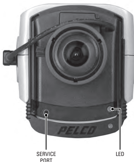
FRONT VIEW, CAMERA ONLY (OPENED TO EXPOSE SERVICE PORT)