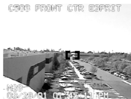
WIDE ANGLE (4 mm)

Multiple 24 VAC camera power supply, indoor Single/multiple 24 VAC camera power supply, outdoor