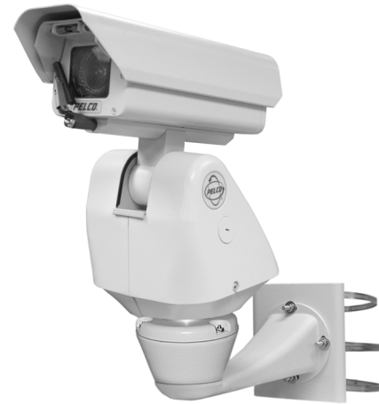
ESPRIT IOP SYSTEM WITH WIPER (SHOWN WITH WALL MOUNT AND POLE ADAPTER)

The ES31C Series includes a window wiper. The wiper is completely integrated into the enclosure and does not interfere with the viewing range of the system. The wiper can be programmed to delay between