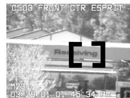
22X (88 mm)