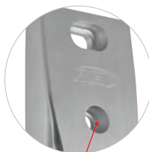
Lockdown holes for secure mount