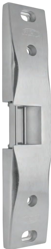
Dimensions 1-3/4" x 9" x 3/4" (45mm x 230mm x 20mm)