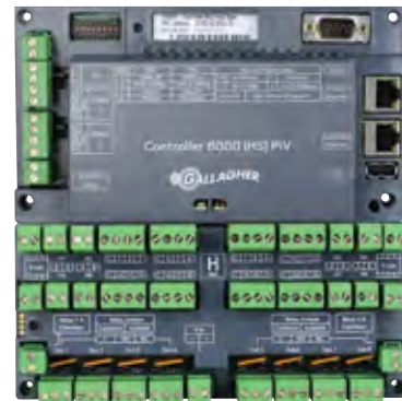
Controller 6000 High Spec - PIV