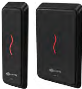
T Series PIV Readers