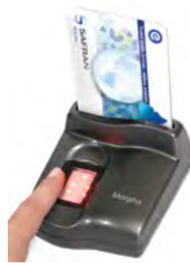
Morpho MSO 1350e