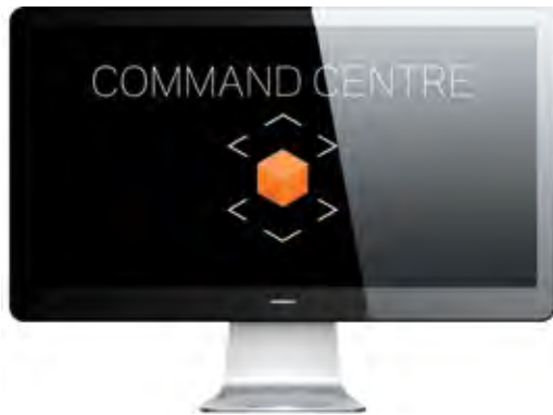
PIV Command Centre