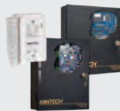
Kantech Door Controller Family