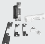
DK-1 Door Hardware Kit