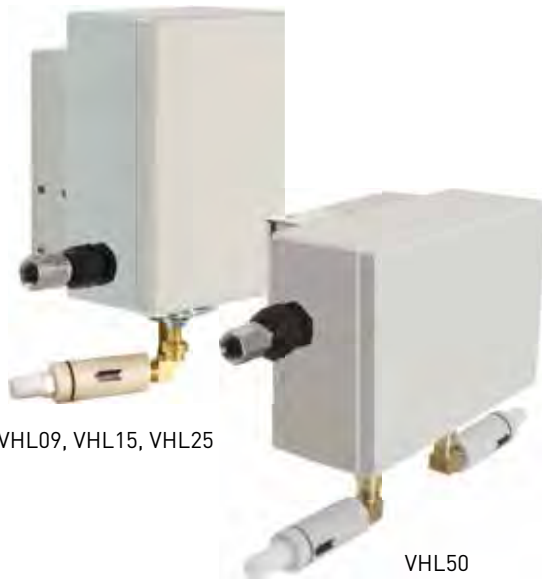
VHL09, VHL15, VHL25