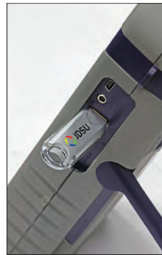
USB flash drive supports transferring test results