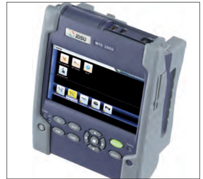
For fiber testing and certification capabilities, combine the Certifier10G with one of the market-leading JDSU fiber testers, such as the T-BERD/MTS-2000