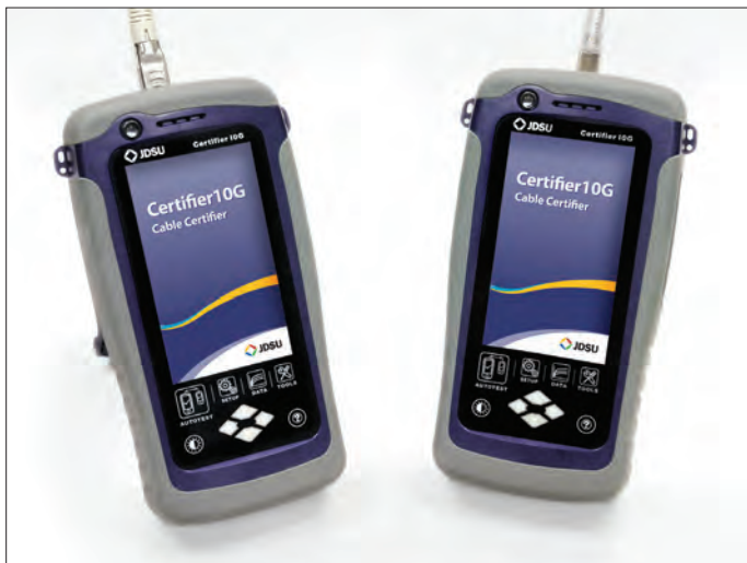
Two complete units minimize time initiating, naming, and saving results