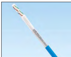
PUP6ASD04BU-UG and PUR6ASD04BU-CG