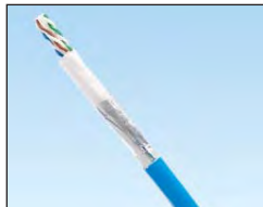
PUP6A04BU-UG and PUR6A04BU-UG