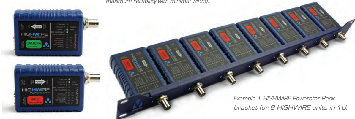
Example 1. HIGHWIRE Powerstar Rack bracket for 8 HIGHWIRE units in 1U.