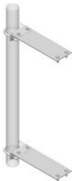
PM-XT-36 Stand-Off Pipe Mount, 36 in stand-off