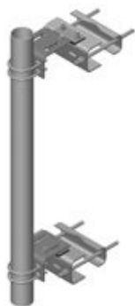
PM-SU2-96 Universal Sliding Pipe Mount Kit for 2-3/8 in OD x 96 in pipe