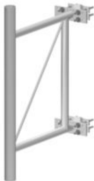
PB-G3T-4 Tapered Pipe Frame Stand-Off Bracket, 36 in, for 4 in to 8 in OD legs