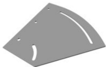
MT-F1573-11 Adjustable Splice for Bridge Kit for four coaxial cable runs