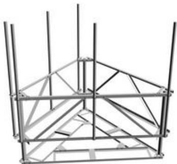
MT-181 Non-Penetrating Sled Kit for multi-sector roof frame