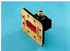
C137LNSG Waveguide/Coaxial Cable Transition for WR137, 5.85–8.2 GHz, with interface types N Female and UDR70, gray