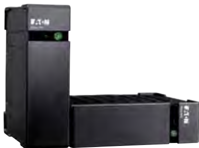
Eaton Ellipse ECO easy integration