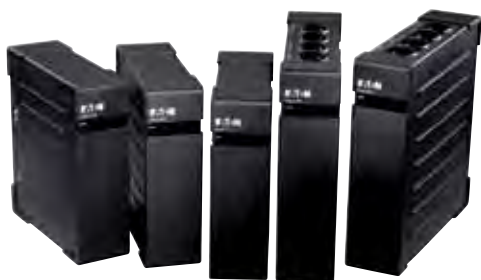
Eaton Ellipse ECO range