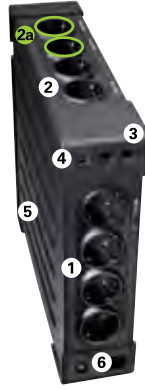
Eaton Ellipse ECO 1200/1600