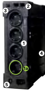
Eaton Ellipse ECO 500/650/800