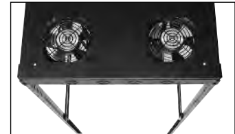
top shown with optional 5-FAN-K fan kit